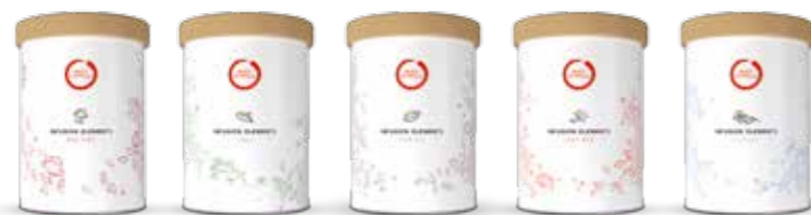
Set of metal tin cans with wooden top.