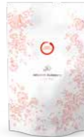
LOVE RED 750 g