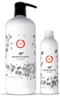
SHAMPOO 1000 ml 250 ml