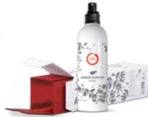
SHINE 200 ml