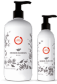
MASK 500 ml 200 ml