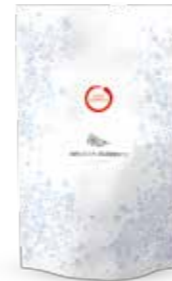
EVEREST 750 g