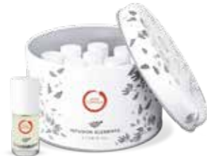
VITAMIN OIL 14 x 6 ml