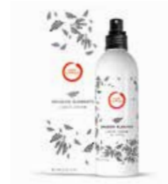
LIQUID CREAM 200 ml