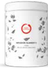
FADE - MILD DECOLORIZING 500 g