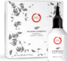
PIGMENTO DIRECT COLOR 4 x 50 ml