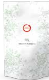
TIBET 750 g