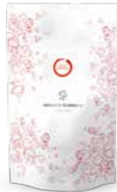
RED FIRE 750 g