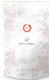
NAMIBIA 750 g