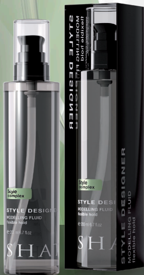
STYLE DESIGNER 200 ml