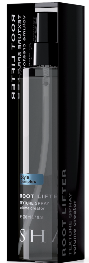
ROOT LIFTER TEXTURE SPRAY volume creator 200 ml