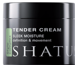
TENDER CREAM SLEEK MOISTURE definition & movement 50 ml