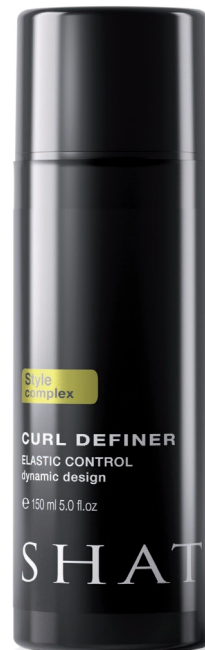
CURL DEFINER ELASTIC CONTROL dynamic design 150 ml