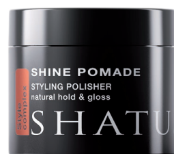
SHINE POMADE STYLING POLISHER natural hold & gloss 50 ml