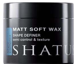
MATT SOFT WAX SHAPE DEFINER semi control & texture 50 ml