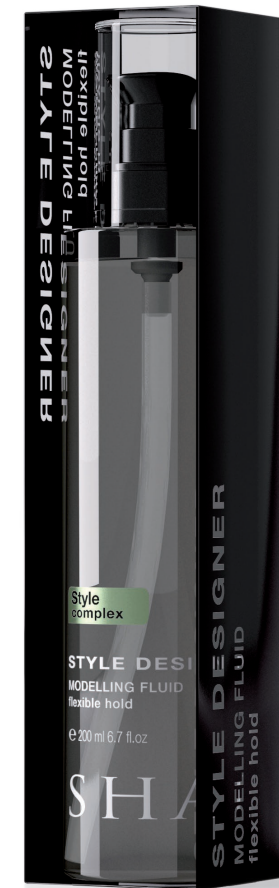
STYLE DESIGNER MODELLING FLUID flexible hold 200 ml